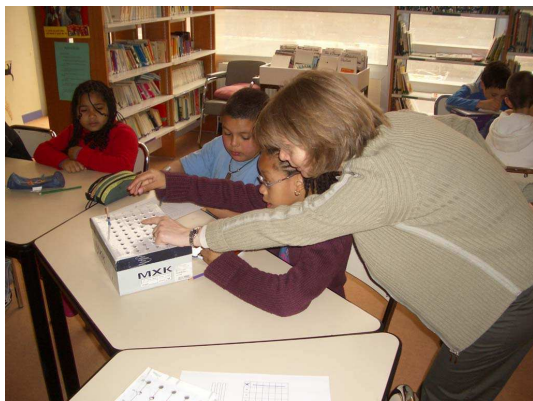
Figure 4: Venus topography box activity: probing the hidden surface.