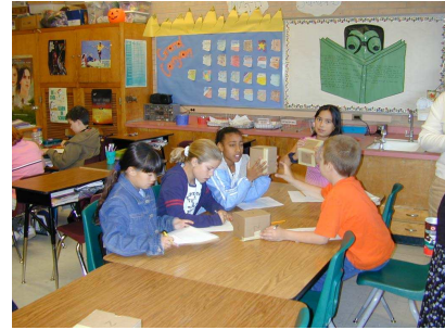
Figure 2: Helioseismology activity: probing the mystery boxes.