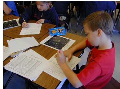
Figure 3: Galaxy activity: classifying the galaxies in the Hubble Deep Field.