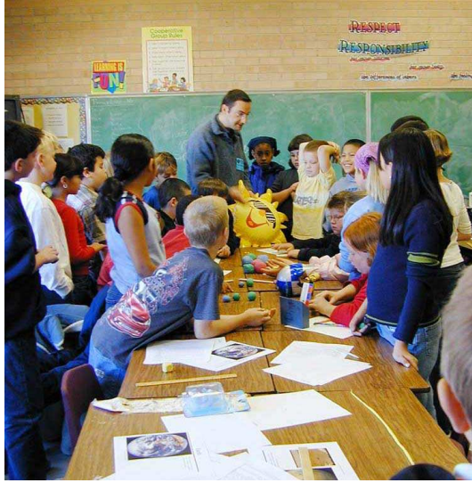
Figure 1: Solar System activity: comparison of the Planet's sizes.