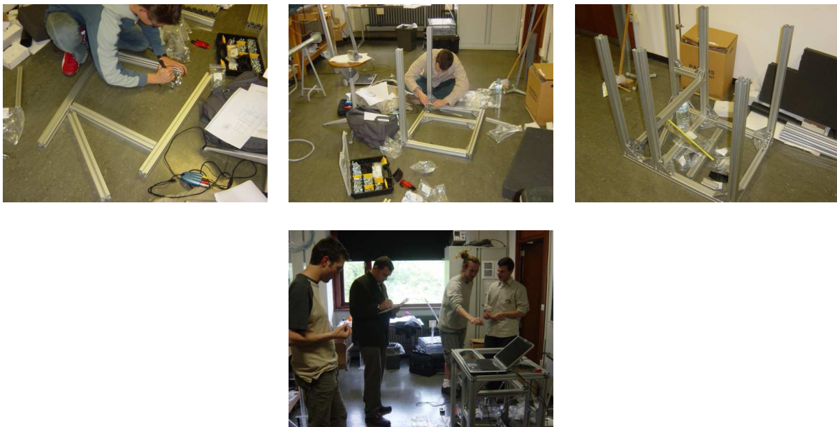
Figure 1: (First row) Starting from scratch but with furnitures and help, students are able to come up with an experimental rack. (Bottom row) This setup is approved as ESA conform.

Students are then asked to write a proposal and submit it to an ESA commission. In case the project fits ESA interests and appears as well fitted for micro-gravity, the young team can start building the flying machine ! Drawing plans is the first and generally the apparently fastest step. Screwing, gluing and hammering is an hard job but one of the most amazing task. This is actually the first time students can build an experimental setup by their own. Figure 1 shows one of our students starting from zero and ending up with a safety visit validating the experiment. Time delay between the first and last images is typically two months.